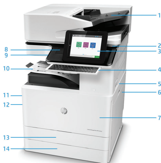
HP LaserJet Managed Flow MFP E72525z